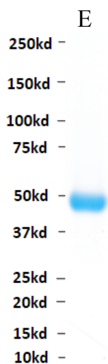
E: Human Poliovirus Receptor-Related Protein 2/PVRL2/CD112